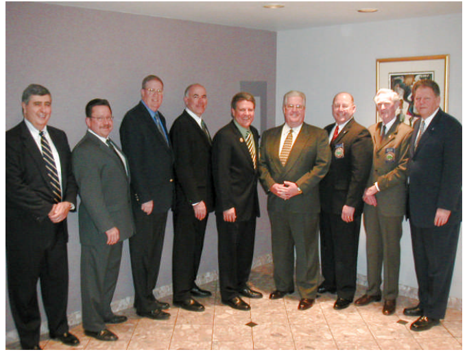
Pictured Above: 2008 Cuyahoga County Police Chiefs Association Officers and Board of Governors