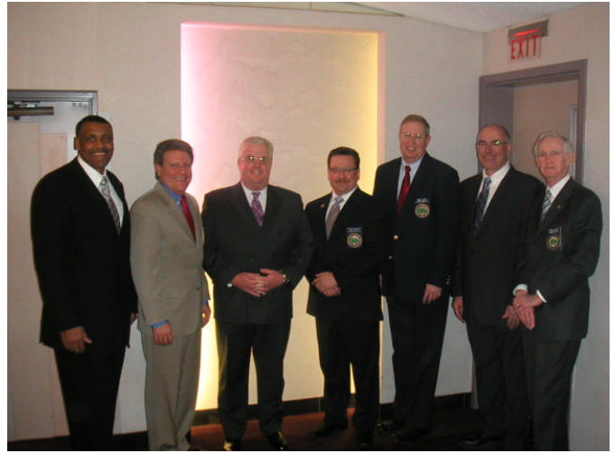
Pictured Above: 2009 Cuyahoga County Police Chiefs Association Officers and Board of Governors